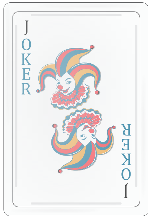
UNPRINTABLE CARD CASE

Blue Line = The SIGNIFICANT PRINT AREA (Keep all critical images & text within this box)